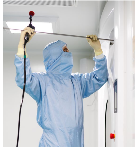
EMERY TEST VALIDATION